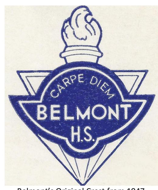
Belmont's Original Crest from 1947