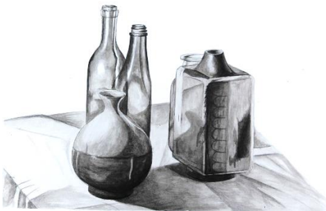
STILL-LIFE DRAWING BY Bellen Wang

Two shows have gone up in the Belmont Bistro gallery display area: ANIMALS AND